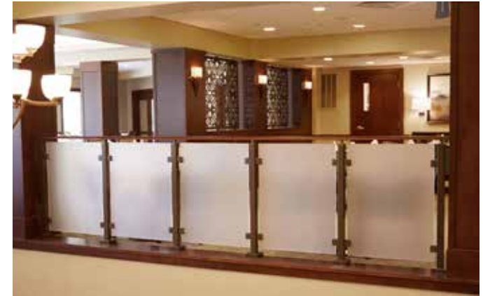
Frosted glass and other glass finish options available. Ask the Design Team!

Laminated glass panels offer many advantages. Our two strongest products are EVA and SGP. The chart to the right shows you how they measure up to each other in five important categories. If you have any questions about laminated glass that aren't answered here, please contact our Design Team for all the help you'll need.