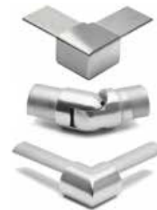
Cap Rail Corners