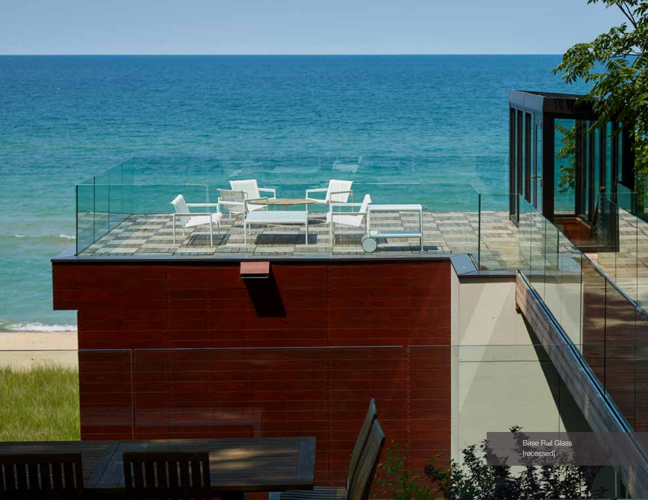
Base Rail Glass [recessed]