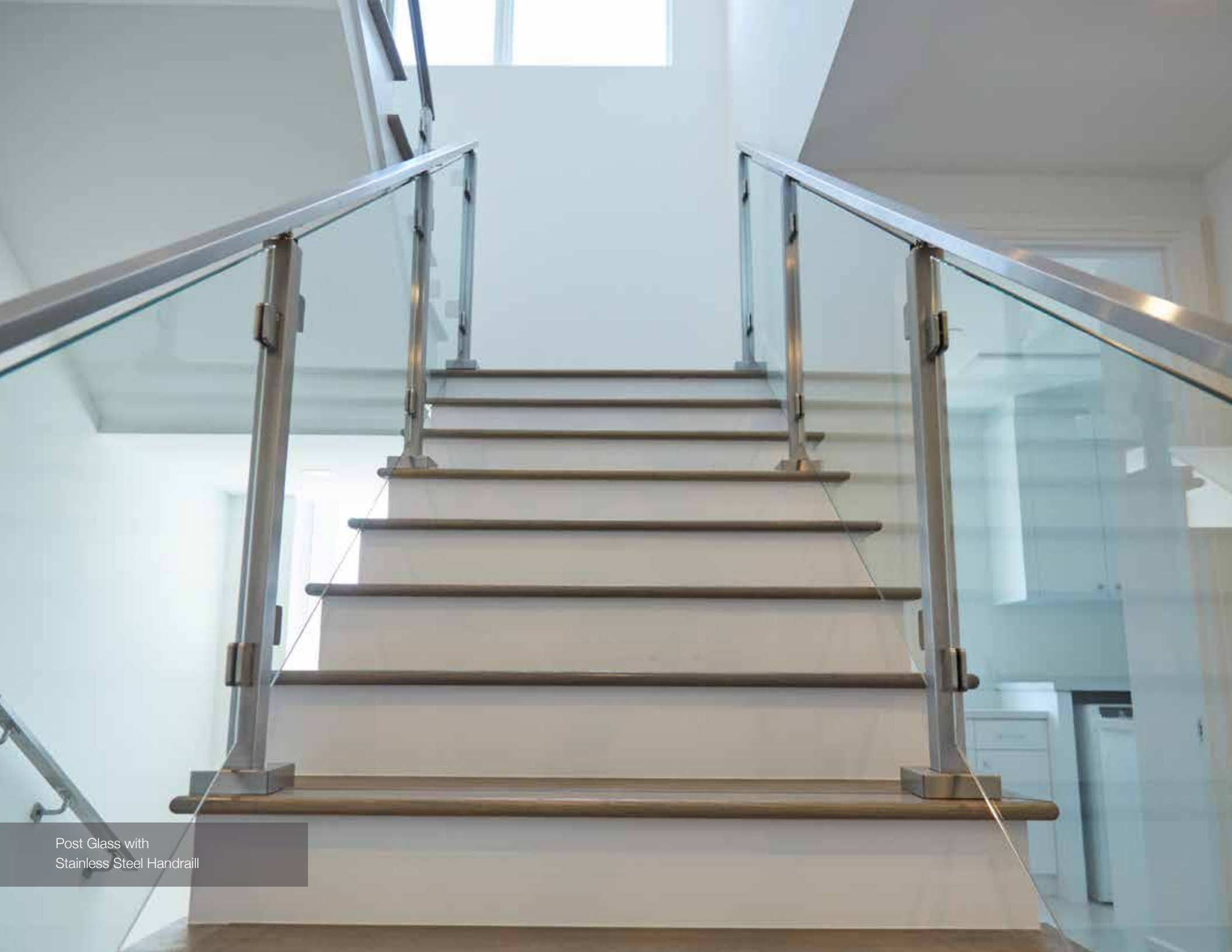
Post Glass with Stainless Steel Handrail