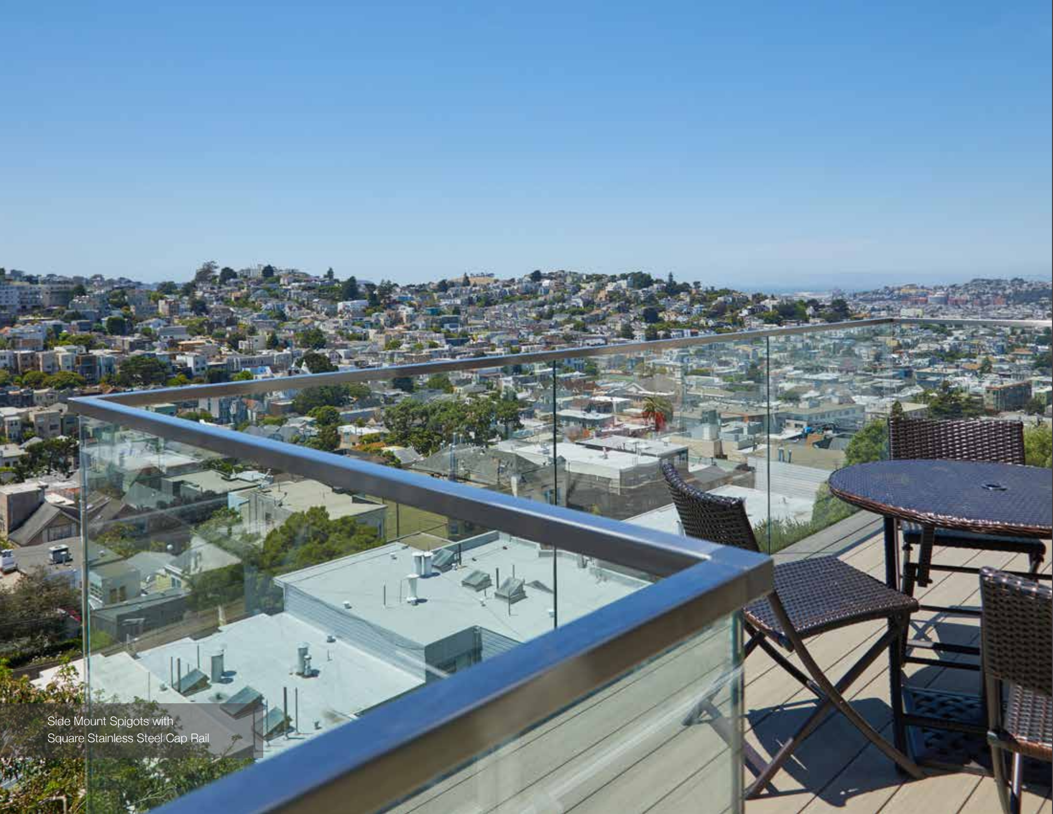
Side Mount Spigots with Square Stainless Steel Cap Rail