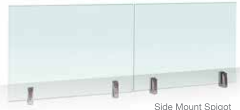
Side Mount Spigot