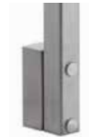
Slim Side Mount Bump Out