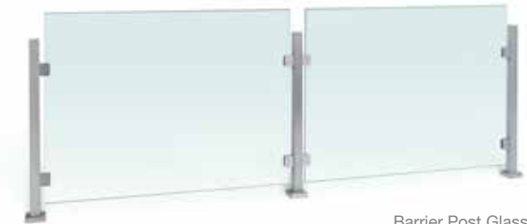
Barrier Post Glass